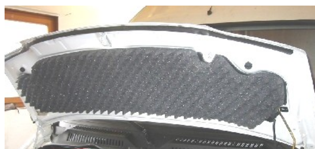
Example: Engine sound insulation cut at a Fiat

Fits for all alcove, semi integrated, box waggons and all listed integrated Models.