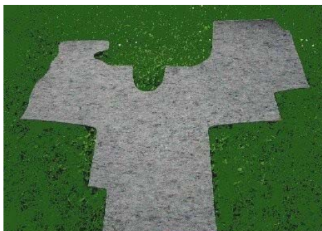
Example: Floor fleece cut for a Mercedes Sprinter

Fits for all alcove, semi integrated, box waggons and all listed integrated Models.