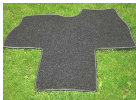
Example: Carpet cut for a Fiat