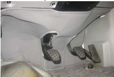
Mercedes Sprinter till build year 1999 / build year 2000 to 2006 driver and co-driver site