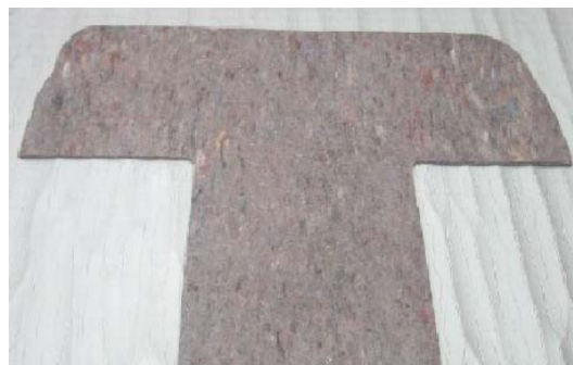
Example: Floor fleece cut for a Fiat