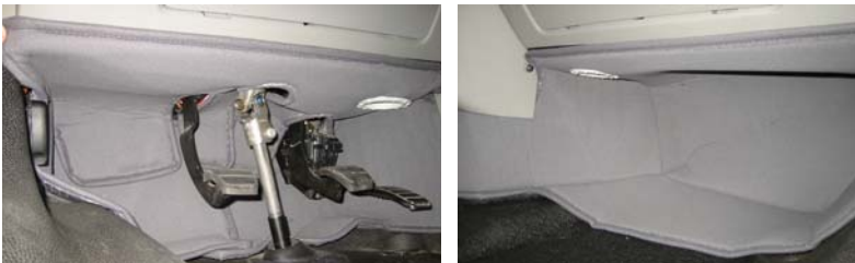
Renault Master ab Bj. 2007