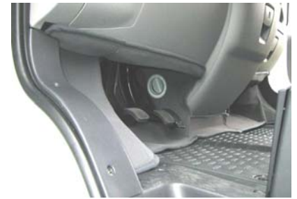
Fiat from build year July 2006 till now