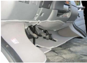
Fiat from build year 1994 to May 2002