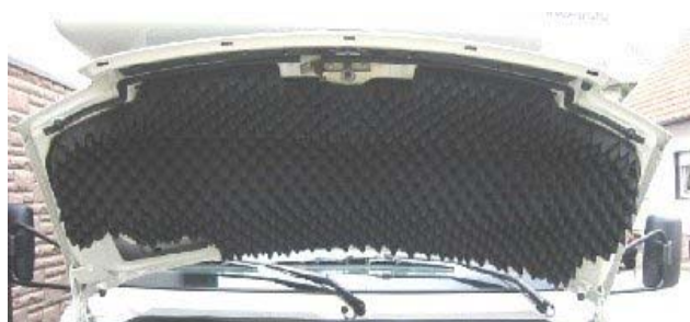
Example: Engine sound insulation cut at a Mercedes Sprinter

Clean the surface with acetone and fix it with our special glue. The special glue is not included. Please order separately. You can find it under the category "glues".