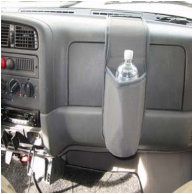
At the dashboard

Can be mounted almost anywhere with velcro: