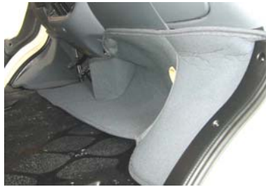
Fiat from build year May 2002 to July 2006