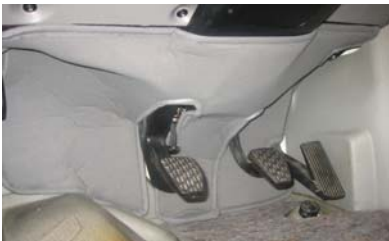
VW LT build year 1997 to 2005 driver and co-driver site