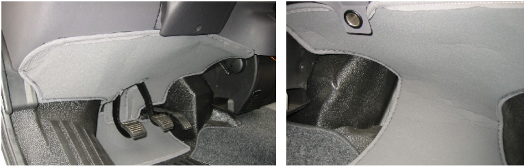
Ford Transit Bj 2000 – 2006 Fahrer- und Beifahrerseite